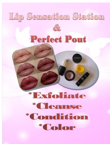
Display for Picture Frame