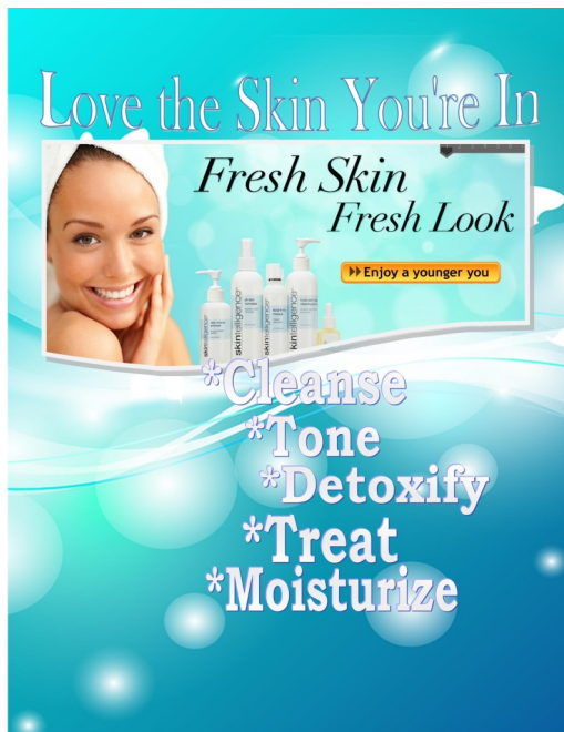
Display for Picture Frame