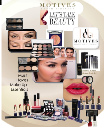
Display for Picture Frame